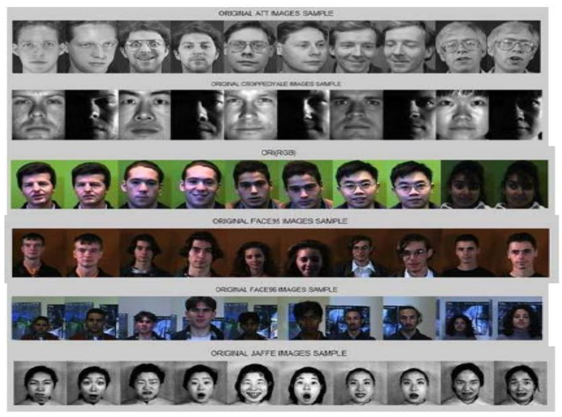
Figure: Images model in dataset (from upward to downward be example of: ATT, CROPPEDYALE, FACE94, FACE95, FACE96 and JAFFE dataset)

In order to appraise the recital of PCA and DCT, a cipher for every algorithm has been produced by Matlab. These algorithms have been verified by six groups of datasets those are COPPEDYALE, FACE94, FACE95, FACE96, JAFFE and AT&T. These datasets are clustered into alienated datasets which embody a group of troubled imagery, as depicted in figure.