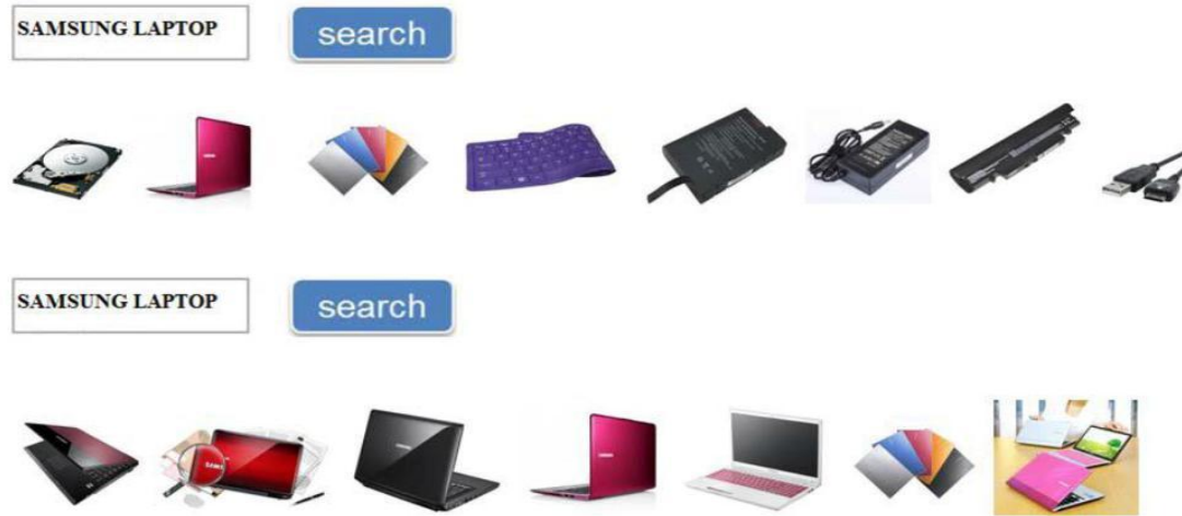
Fig. 1: non- individualized and individualized search consequences for the query “Samsung Laptop”.

Seeking for apple via a planter has a diverse gist from seeking by a technical one. Here is an elucidation to crack these difficulties is adapted explore where customer explicit data is deemed to differentiate among precise targets of client inquiries and re-ranked the pictures.