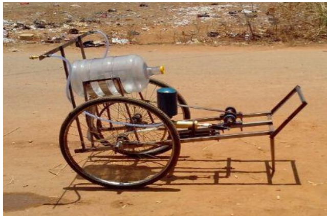
Figure 3: Actual model of the equipment

to pump the air into the tank which maintains the pressure for the spraying. In this equipment the reciprocating pump take place reciprocating action by two methods one is by moving the equipment.