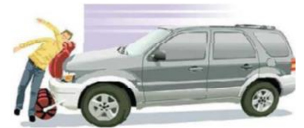
Fig-1 Actual function of car bumper (source: Cheon S.S, 1995)

A bumper is sometimes designed for providing a shielding and providing the security from the collision. Bumper is usually created of steel, metal rubber or plastic that is mounted on front of a vehicle. The most perform of the bumper is to soak up energy and shocks and to cut back the injury which can have an effect on the automotive. Some bumper use energy absorbers or created with foam artifact material. Bumpers also are designed to prevent or reduce the physical injury and to guard the hood, trunk, grille, fuel tank, exhaust and radiator besides the engine or front half. Bumpers are supposed to prevent injury to occupants within the cars. They are also designed so that the cars can collide without much danger to the drivers and also provide cushioning effect to pedestrians.