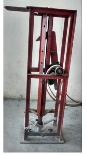
Fig. 1.0 Schruder's impact testing machine- A fabricated equipment

h = height of the fall = 45.7cm = 0.457m n = number of blows required to cause first crack or final failure as the case may be.