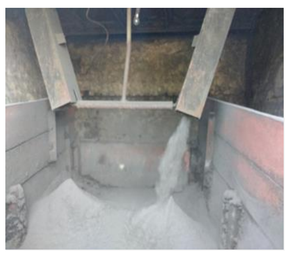
Fig 3.3: Site view of Burnt sugarcane bagasse ash Table 3. 1: Chemical composition, loss on ignition, and specific gravity of OPC and SCBA.