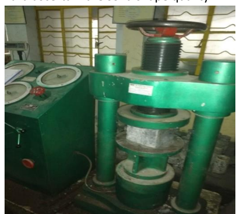
Figure 8.1: Picture showing the compressive testing for cubes

3. Apply stack with no stun and persistently increment at the rate of roughly at 140 kg/sq.cm every moment until no more prominent load is supported by the example. Take note of the most extreme load is connected to the specimen. And afterward ascertain the solid shape quality.