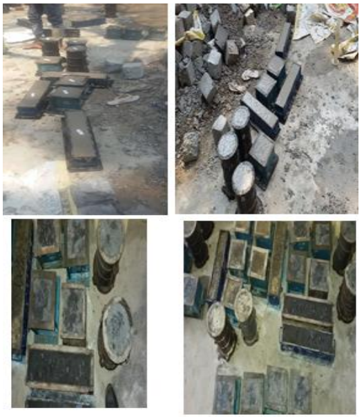
Figure 8.4: Pictures shows the Casted specimens Strength results and graphs

Strength results & graphs hardened properties of trail mixes sugarcane bagasse ash as an admixture