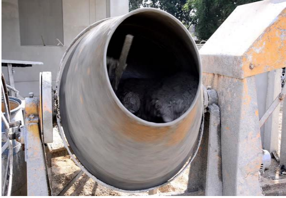
Figure 7.1: site view of mixer machine A concrete blender is a gadget that homogeneously consolidates concrete, total, for example, sand or rock, and water to frame concrete. A regular concrete blender utilizes a rotating drum to blend the segments. For littler volume works compact concrete blenders are frequently utilized so that the

Mixing procedure of concrete: Blending a. system of solid: Concrete is blended by any two techniques, in view of prerequisite according to quality and amount of cement required. Ordinarily for mass solid, where great nature of cement is required, mechanical blender is utilized. Blending by hand is utilized just to particular situations where quality control is not of much significance and amount of cement required is less. Stone total is washed with water to expel earth, clean or some other outside material before blending. In the event that the amount of cement is very sufficiently little to do with prepared blend with hand blending then blend machine is accustomed to blending concrete. It is accommodation to utilize blend machine for blending little amount of cement. Creating concrete with blend machine is substantially speedier than hand blending. Ordinarily the limit of blend machine is 4 to 9 cubic feet of cement.