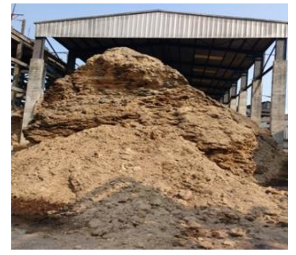
Fig 3. 2: Site view of Raw sugar cane bagasse