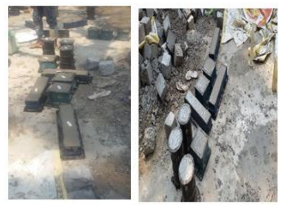
Figure 8.2: pictures indicating the flexural strength Split tensile strength test

6. Take note of the greatest load taken by shaft without break.