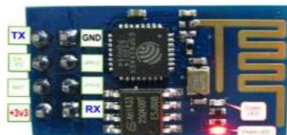
Fig.2 ESP8266 Pin Details

Once it gets connected in a Wi-Fi network, we'll get one IP address which is accessible in its local network. The module is additionally having 2 GPIO pins alongside UART pins. It is also having inbuilt SPI protocol by using the two pins of UART as data lines and by configuring the two GPIO pins as control lines and clock signal. It is also having 1MB on-chip flash memory. Internally it is having power management unit with all regulators and PLLs. The on-chip processor it is having is a 32 bit CPU.