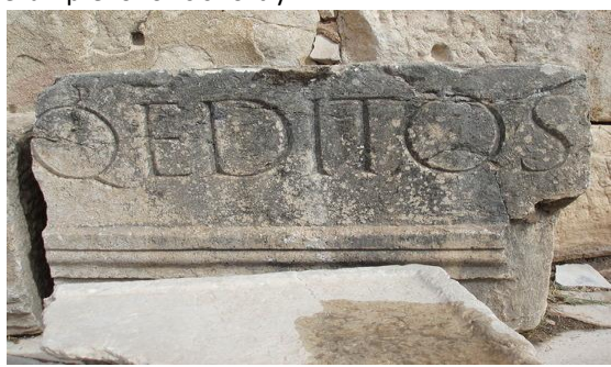
Fig 3: Roman Script Printed on Stone The most important characteristics of online documents are that they capture the direction of

Today, Language identification is the main issue, even more when multiple languages are mixed up in one document. This paper present the multilingual language identification, it involves three parts. The first part is monolingual identification (Fig 4) Many methods with very high precision are available for this part. The second part is language enumeration i.e., finding out what languages are present in the document. The third part is segment identification i.e., identifying the language of segments of text in the document. If the segments are assumed to be single words, we can further divide the problem into word type identification and word token identification. In this first work on formulating the problem of multilingual language identification and solving it in a systematic way, we propose a method to solve the language enumeration and segment identification.