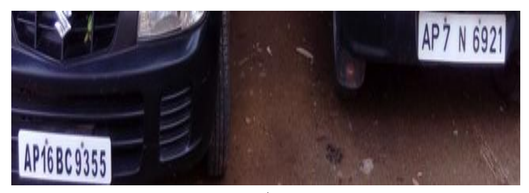
Fig: Original image