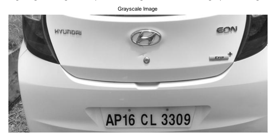
Fig: Gray scale image

Median filtering is applied to the gray scale image. The resultant image is as shown below-