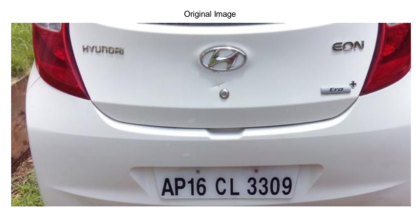
Fig: Original image The input color image is converted into gray scale image.

Input color image is taken for which we need to extract the vehicle.