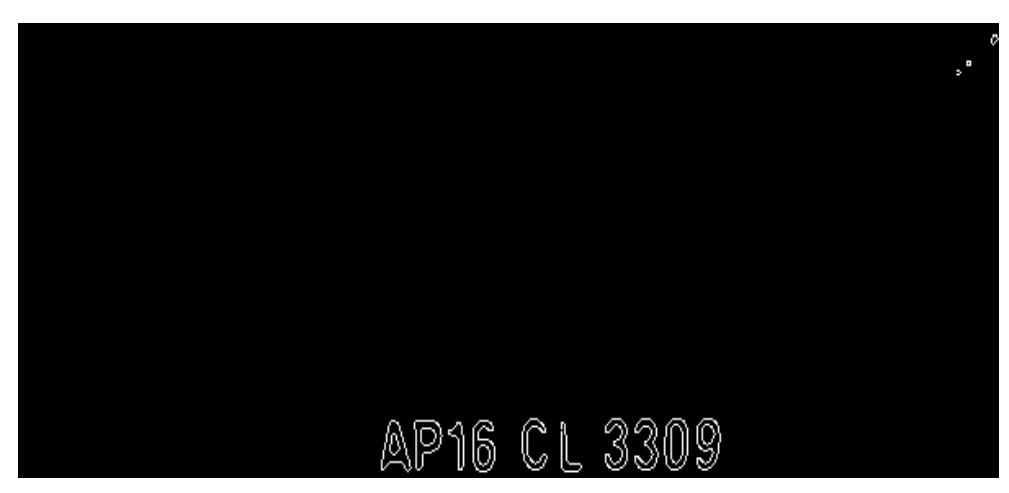
Fig: Output after edge detection

After filling holes we can obtain the final output.