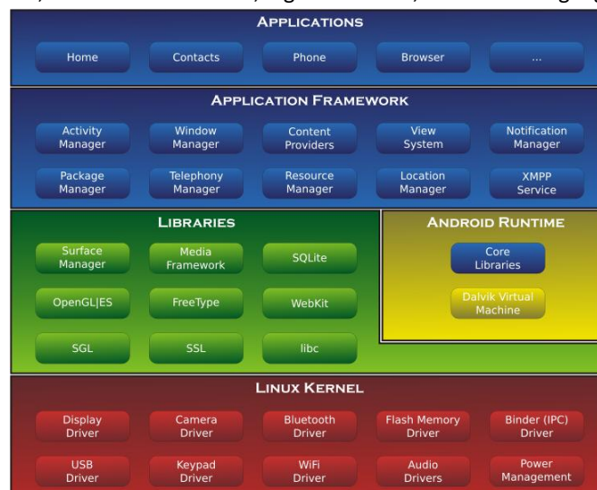
Fig. 5. Android's architecture diagram.

Android is an operating system works on the Linux kernel. Every mobile or tablet comes with the Linux kernel version number. A client interface focused around immediate control, composed basically for touch screen cell phones, for example, cell phones and tablet workstations, utilizing touch inputs, that approximately relate to certifiable movements, such as swiping, tapping, squeezing, and opposite squeezing to control on-screen items, and a virtual console. In spite of being essential intended for touchscreen information, it additionally has been utilized within TVs, recreations comforts, digital cameras, and different gadgets.