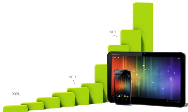
Fig. 2. Android Growth in device activations.

Android helps a huge number of gadgets in more than 190 nations around the globe. At the point when contrasted with any viable stage Android stage is developing limitlessly consistently an alternate a huge number of client's begin their Android gadgets shockingly and searching for applications, diversions, and other media content. Android provides for you an open stage for making applications and diversions for Android clients all over, and a commercial center for disseminating to them quickly.