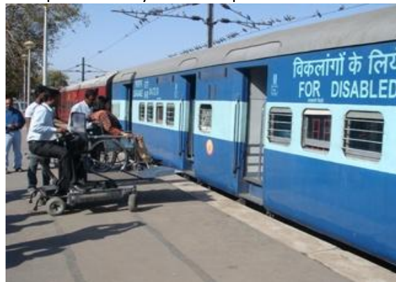
Fig 2: Disabled people need mobile lifters and devices to get onboard the train coaches

It is also known that the disabled have to be carried onto the train in specially designed trolleys or lifters. The use of these devices is time consuming as well as not available in many stations. The procedure needs to be simpler, quicker and which can be performed by one other person.