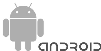
Fig. 3. The Android mascot.

In spite of the fact that Android has numerous inventive peculiarities not accessible in existing versatile stages, its originators likewise leveraged numerous reliable methodologies demonstrated to work in the remote world. It's actually that a large portion of these gimmicks show up in existing exclusive stages, yet Android joins them in a free and open design, while at the same time tending to an significant number of the defects on these contending stages. The Android mascot is somewhat green robot, indicated in Figure 3. you'll see this little fellow (young lady?) regularly used to delineate Android-related materials. Android is the first in another era of versatile stages, providing for its stage designers a unique edge on the opposition. Android's fashioners analyzed the profits and inconveniences of existing stages and after that join their best gimmicks. In the meantime, Android's planners stayed away from the slip-ups others endured previously.