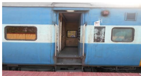
Fig 1: The floor to platform level in trains is at an uncomfortable level, even with the side handles and the gaps can be dangerous

In India, the floor height of express and long-distance trains is not compatible with the platform height and changes. In most cases, the distance increases beyond comfort limit of the passengers. The problem becomes more prominent when people struggle to climb aboard and get down from trains on to the platforms because of steep exterior steps which often lead to accidents and injuries. This is mostly seen with small kids, women, elderly, people with arthritis or gout and others and also while moving heavy luggage in and out of the train. The problem aggravates when the train stops only for a few minutes at a station and the number of passengers getting down and up are numerous. This problem causes delays at the stations and unnecessary rush. It is a problem in all stations. The steep vertical steps can prove to be a hindrance in case of a quick rescue mechanism. In all the above cases, a simple construction of platform risers and gap fillers can make a huge difference. Risers can be used to adjust platform to train floor difference and gap fillers to bridge same level gaps between the train and platform.